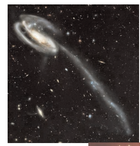
UGC 10214 The Tadpole Galaxy in Draco This image is constructed from three separate images taken in near-infrared, orange, and blue filters. Photo taken on April 1 and 9, 2002.