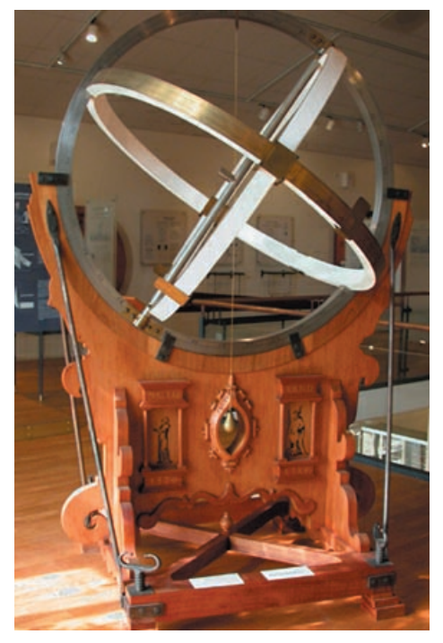
A replica of Tycho Brahe's armillary.

his observatory on a small island, Hven, about 30 miles north of Copenhagen, and called it Uraniborg. Unfortunately, it was destroyed a long time ago; the Swedish government is only partway through the process of recreating it as a park/museum. What does exist are detail drawings of his observatory and equipment. Craftsmen have