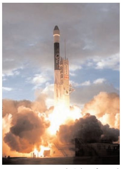
A Boeing Delta II (7326) rocket launched the New Millennium Program Deep Space 1 spacecraft on October 24, 1998.

two raw eggs to a height of exactly 1,500 feet, and then returning the eggs to the ground unbroken. The team that comes closest to 1,500 feet without breaking their eggs will win the national title.