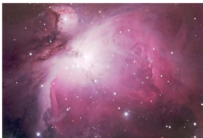
M42 / NGC 1976 - The Orion Nebula. This image was taken in November 2005 using a 13" f4 scope and a ST10XME 1x1 -15C camera, with a compilation of 20 1 minute exposures in the RGB channel.