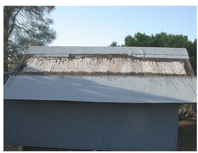
The damage to the roof is quite obvious.