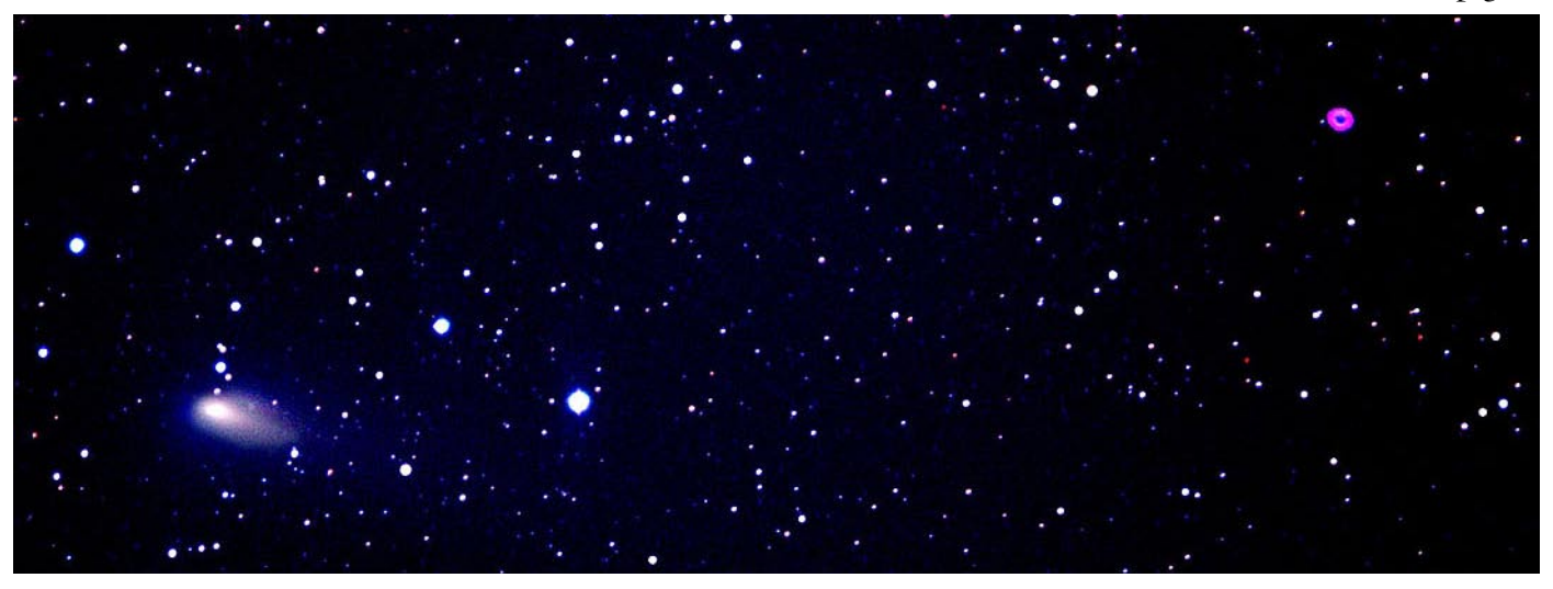
Comet 73P/Schwassmann-Wachmann 3-C (the "C" fragment) just a few hours after it passed M57 the night of May 8th. LRGB composite taken with an ST-10XME CCD camera through a Takahashi FSQ-106 from my backyard here in Pleasanton; processed using MaximDL and Photoshop.