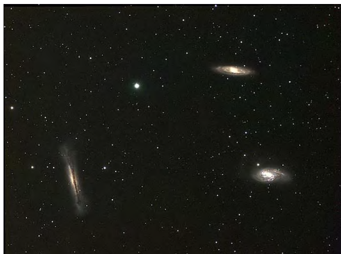
The Leo Triplet: M65, M66, and NGC3628 imaged with a Takahashi FS-102 and an ST-2000XM CCD. The total exposure time was 10 hours on the nights of 16-17 March 2007 (LRGB, 2.5 hours each, 1x1 bin).

Don't miss your chance to embark on a daring exploration of comets aboard the C.L.C. Spacecraft! The mission's