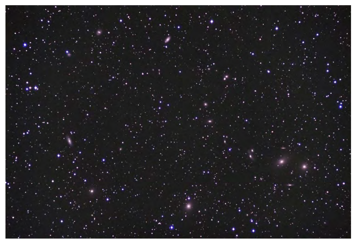
NGC 4486 (M87) and the center of the Virgo Galaxy Cluster.

The image was taken with a 200mm f/4 telephoto lens with an ST10XME CCD camera, and is about 105 minutes of exposure time. For a larger view, visit http://www.trivalleystargazers.org/gert/CCD_Galery/ngc4486_st10xme_200mm.html.