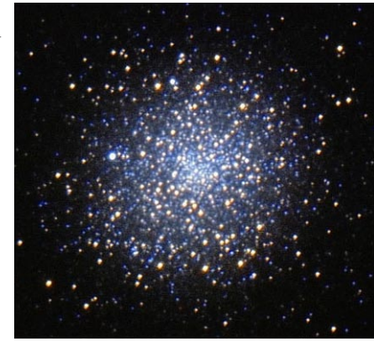
M2 Globular Cluster.