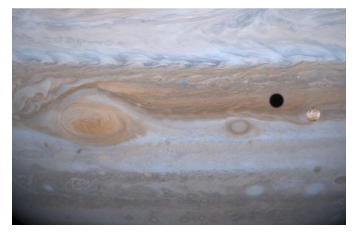
Jupiter and lo as seen by the Cassini spacecraft as it passed by on its way to Saturn.

Jupiter is slowing fading into the sunset, getting lower and lower. We'll have to wait for it to make its next evening viewing appearances in August 2008 for the next installment of Jupiter Transits.