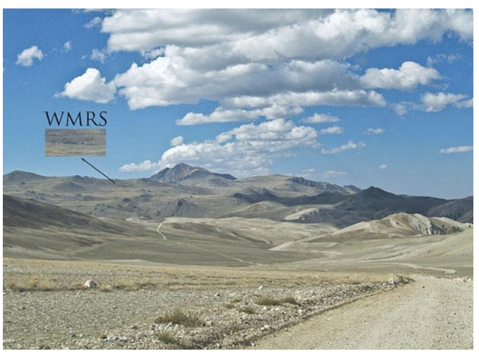
The Road to Barcroft, starring Bob Hope and Bing Crosby. Hilarity ensues as we follow the intrepid explorers along the desolate road to the Great Quonset Hut in the Sky.

Area are hard to miss at Barcroft. Did I mention it was very dark there?