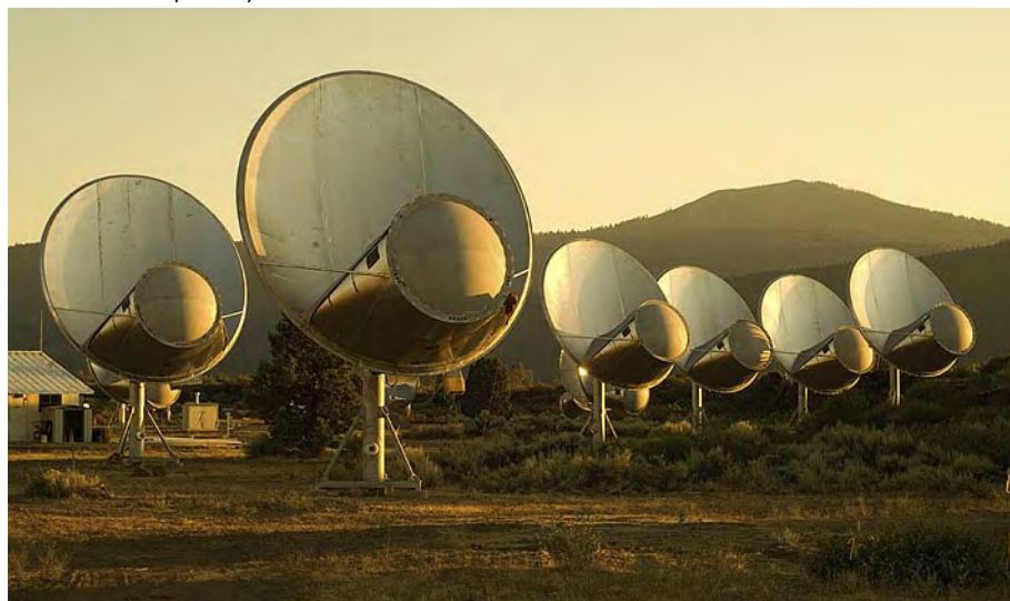
The Allen Telescope Array

The ATA was initially funded by Microsoft co-founder Paul Allen, with the goal to have 350 small radio telescopes working together as one large telescope. Right now, they have the initial 42 telescopes up and running. The ATA is involved with a number of research projects, studying galaxies, gamma ray bursts, transient radio sources, and SETI. The ATA is a joint project of UC Berkeley's Radio Astronomy Lab and the SETI Institute.