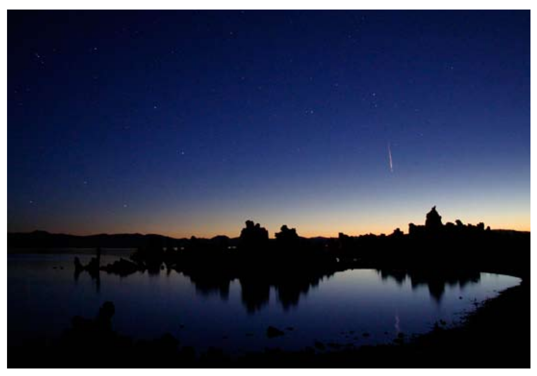
Ken Sperber took this image of a Perseid meteor in the predawn sky over the South Tufa of Mono Lake on August 13, 2010. Note the reflection of the meteor in the lake. The 25-second photo was taken with a Sony DSC-W300 using a focal length of 8mm at f/2.8 and ISO-400.