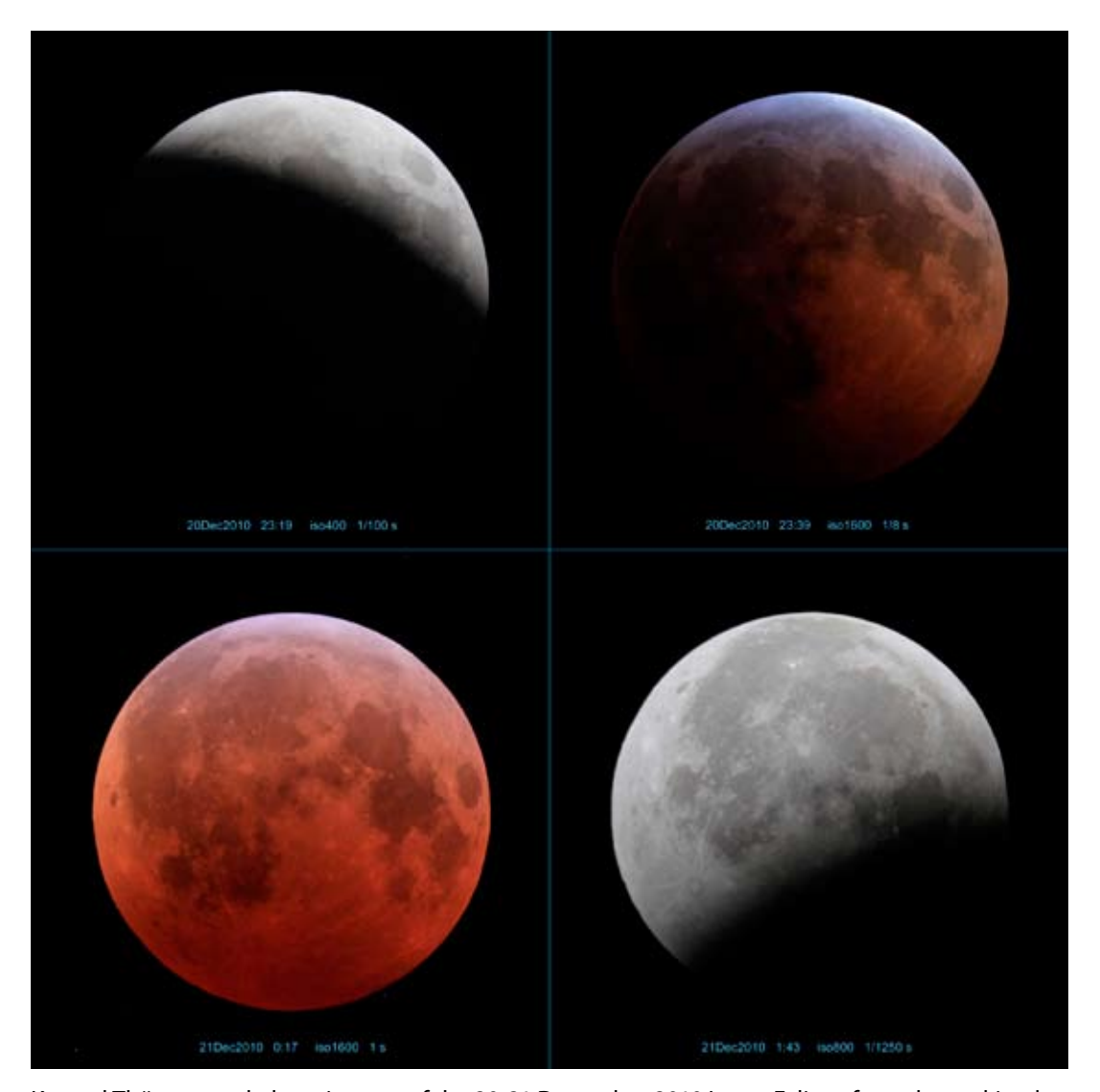
Konrad Thürmer took these images of the 20-21 December 2010 Lunar Eclipse from the parking lot of the Livermore Library. He used a Canon full-frame DSLR attached to a Celestron CPC800 with focal reducer (1280mm f/6.3). This was the first time he used this camera for night sky imaging!

Pluto and Why It Had It Coming," and he will be signing books after the lecture.