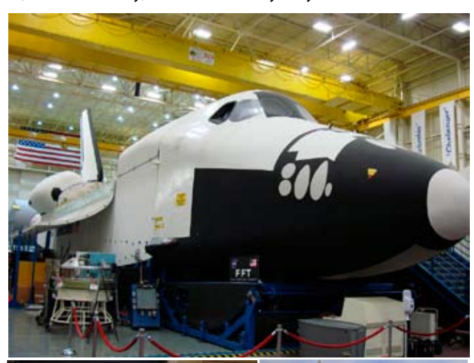
image below) used for astronaut training, as well as futuristic manned an unmanned vehicles for surface operations on the Moon and/or Mars (see Robonaut image below), (3) Ellington Airport, where, from the tarmac, we saw the arrival of a T38 jet piloted by an astronaut, and (4) a guided tour of Rocket Park (otherwise open to the public; see image below which shows a Mercury Redstone and an F-1 engine from a Saturn V). Unfortunately, the neutral buoyancy lab was closed.

In late December, Karen and I took a trip to the Johnson Space Center for the "Level 9 Tour," which gives access to facilities that are normally not accessible to the general public. The tour is limited to 12 people per day, and lasts about 5 hours. Among the highlights were (1) the historic Apollo Mission Control (where you can sit at the consoles) and the shuttle and ISS mission control rooms, (2) the vehicle mock-up training facility, where we saw numerous shuttle mock-ups (see