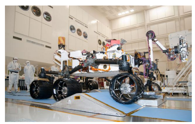
Caption: The Mars Science Laboratory being assembled in a clean room at the NASA Jet Propulsion Laboratory.

The Mars Science Lander (MSL) is scheduled to launch to Mars at the end of this year, with arrival at Mars in August 2012. There are four landing site possibilities, Eberswalde Crater, Gale Crater, Holden Crater, and Mawrth Vallis. All of these sites are at least 1450-4451 meters below the mean elevation of the Martian surface to ensure a