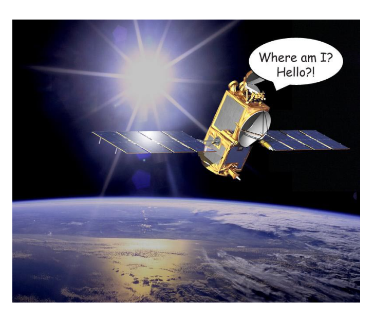
Caption: Artist's rendering: The Galaxy 15 communication satellite was "brainless" for several months in 2010 after being exposed to a geomagnetic storm. The new GOES-R satellite will warn of such dangers.

This article was provided courtesy of the Jet Propulsion Laboratory, California Institute of Technology, under a contract with the National Aeronautics and Space Administration.