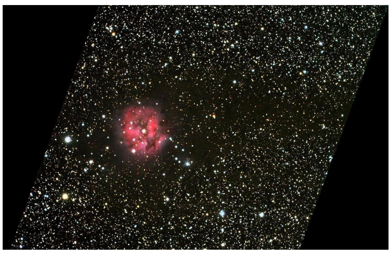
<u>Caption:</u> Ken Sperber took this image of IC5146, the Cocoon Nebbula, on September 3, 2005 using a Takahasi FS-102 at f/6. with L(6x10 min, RGB(4x5 min, 2x2x bin)..