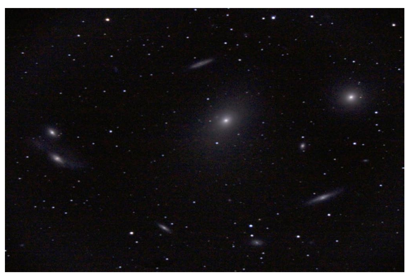
<u>Caption:</u> Konrad Thuermer took this image of the Virgo Nonet, the nine galaxies around M86, near the center of our local galaxy super cluster, around 50-60 Million light years away. The image is the average of six 2-minute exposures taken with a DSLR (Canon EOS 5D) attached to a Celestron CPC800 with focal reducer (1280mm f/6.3, no guiding). He took these images during the rather windy night April 29/30 from a dark location west of Coalinga.

19-22 Sun- Mars and The Pleiades are within 5 degrees of each other, a fine binocular view (pre-dawn)