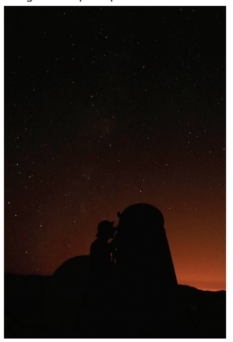
Caption: Observing at a star party at H2O. The Milky Way is visible despite the light pollution from San Jose.

It's that time of the year again! Come to the meeting to cast your vote for the clubs elected officials. Feel free to nominate your fellow club members, or even self-nominate should you be interested in serving.