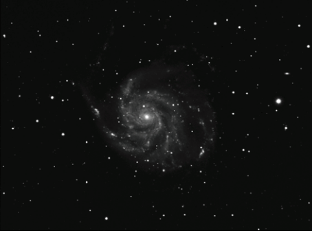
Caption: Comparison images showing Type la Supernova 2011FE in M101.

This presentation will explore recent highlights of our efforts to develop first principles understanding through the application of multi-dimensional hydrodynamic models of SNe Ia.