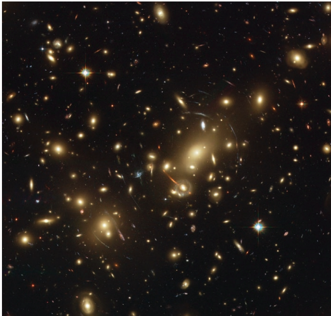
Image Caption: Abell 2218.

As we look at the universe on larger and larger scales, from stars to galaxies to groups to the largest galaxy clusters, we become able to perceive objects that are significantly farther away. But as we consider these larger classes of objects, they don't merely emit increased amounts of light, but they also contain increased amounts of mass. Under the best of circumstances, these gravitational clumps can open up a window to the distant universe well beyond what any astronomer could hope to see otherwise.